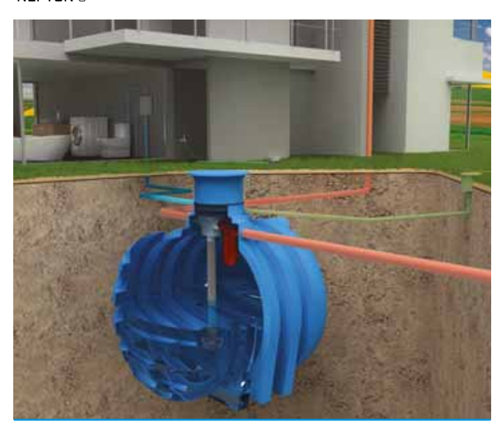
NEPTUN installed with inflow set